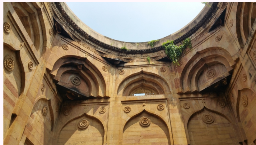
Shehzadi ka Rauza, one of the most impressive tombs in Chanderi

Khwaja Nizamuddin Auliya : A few minutes walk from Badal Mahal takes one to another monument, marked by the most beautiful jaali screens. This houses the tombs of the family of the great Sufi Saint, from Delhi, Khwaja Nizamuddin Auliya.