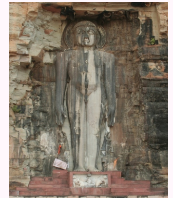
A colossal statue of the Jain Tirthankar Mahavir

Battisi Baoli : Of all the baolis in Chanderi perhaps the most spectacular is Battisi Baoli. Protected by the Archaeological Survey