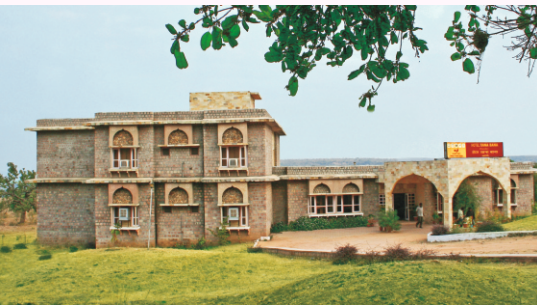
Tana Bana, Chanderi